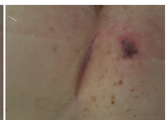
Figure 5: Red area in August 2018