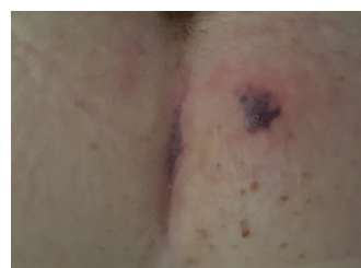
Figure 4: Red area in July 2018 (approximately 10 days after the start of the trial)

"The Vicair seating trial has gone extremely well showing a marked improvement over my current Jay Active. Of particular note is a fading of the dark patch and general skin colour improvement over a relatively short period of around 10 days (see attached comparison photos).