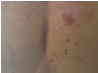
Figure 6: Red area in September 2018

Given I was up and about the day after surgery I was feeling a bit fragile and unable to perform normal pressure relief regime. The Vicair appears to have given the needed protection even though my movements been greatly reduced...I'm extremely happy as you can imagine, attached pics show botty day before surgery and last night!"