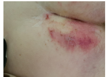
Figure 1: Red area at the start of the trial

His occupational therapist wanted to investigate cushions which could provide robust postural support but would be light weight, easier to maintain and provide the best pressure care.